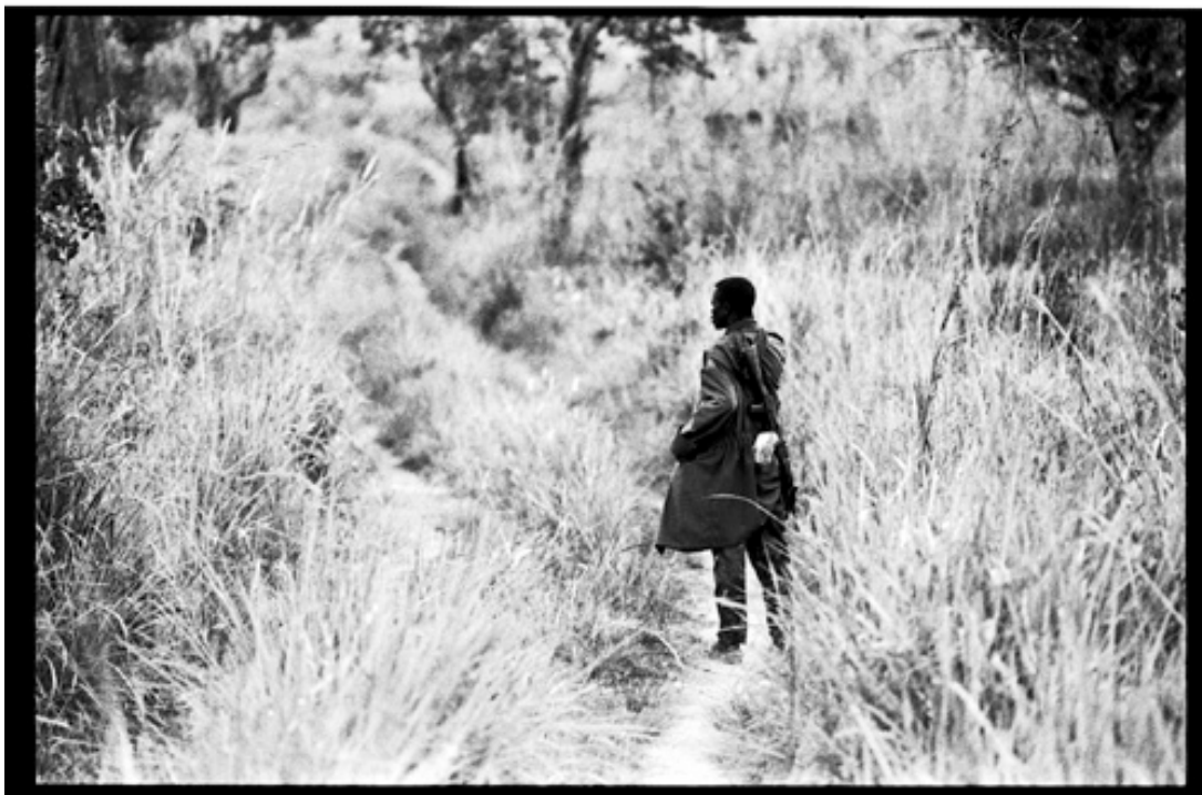
Militia soldier talking on is cell-phone while guarding the killing fields of Bogoro.

The grassy plains of Bogoro were guarded by soldiers and when I arrived the militia of the day wore black trench coats and black mirror sunglasses to enhance the aura of terror that surrounds them. With AK-47's slung over their shoulders they talked on shiny Nokias and Motorolas and Samsungs—cellphones built with the blood minerals of the Congolese people.